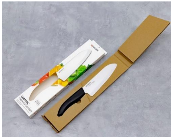
Kyocera's new packaging material - inlay