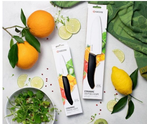
Kyocera's new packaging material – outside design